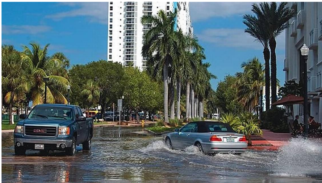
Miami Beach streets flood in 2013 during King Tide.